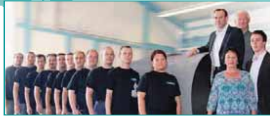
The KERN -Team